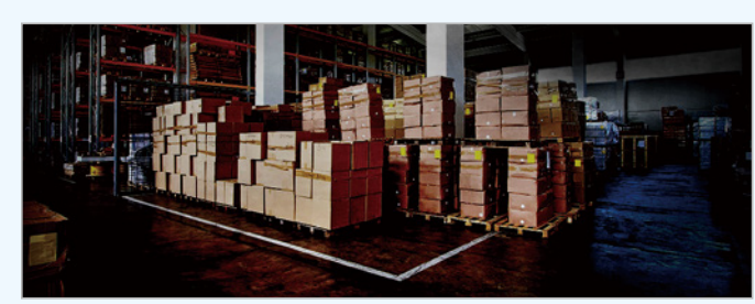
VIVOTEK SNV Camera - Show you true colors in the dark