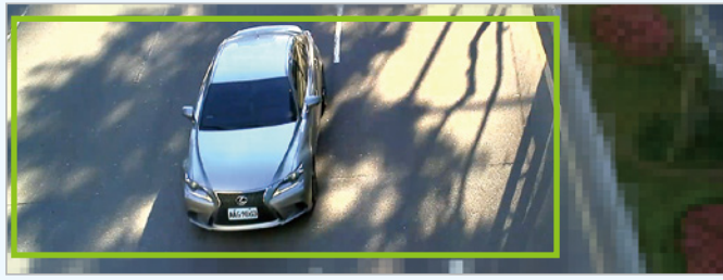
Smart Stream - Manual Mode