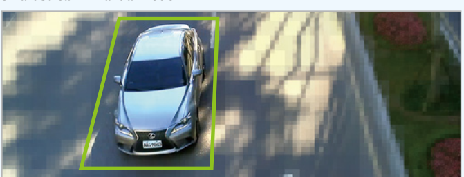
Smart Stream - Auto Mode