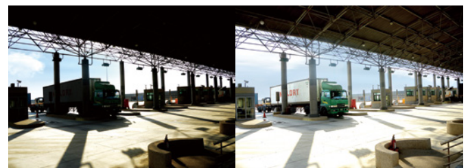
Without WDR Pro