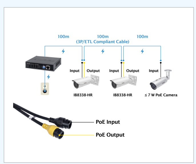
Embedded PoE Extender