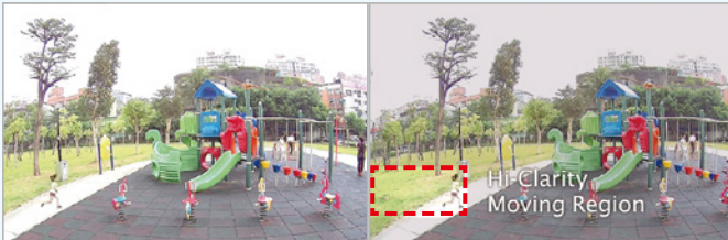
Without Smart Stream II