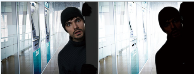
With WDR Pro